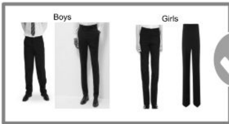
Trousers must be black, loose or slim fitting.